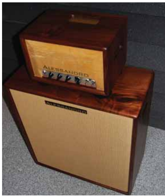
Alessandro Italian Greyhound

With the demand for vintage amps growing and the supply limited, prices for these classic units have skyrocketed. This fact, along with an overall decline in quality among many big-name manufacturers resulting from increased